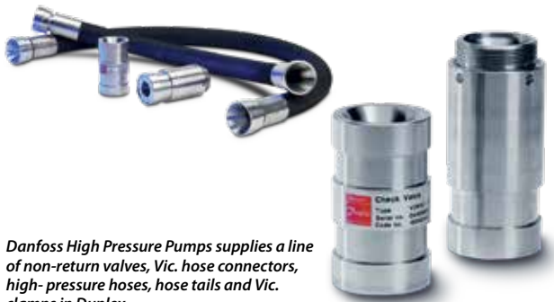
Danfoss High Pressure Pumps supplies a line of non-return valves, Vic. hose connectors, high-pressure hoses, hose tails and Vic. clamps in Duplex.

Capacity: Wide flow range that fits to our pump range.