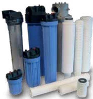
A wide range of filter housings and cartridges for pre-filtration is available.

It is recommended to use filters from the Danfoss filter product range.