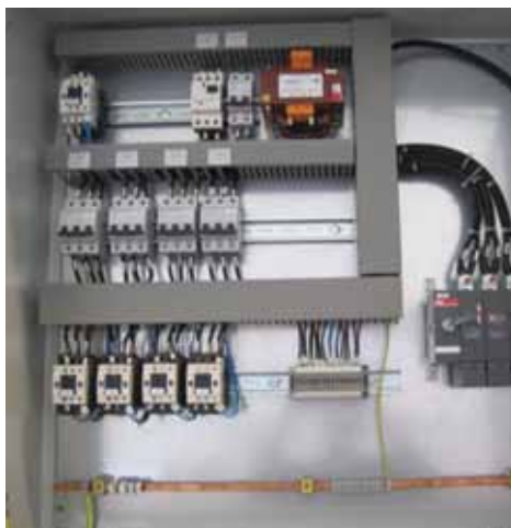
Control panel for the Aalborg EH electrical heater