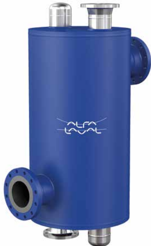
Plate-and-shell benefits made better

Learn more at www.alfalaval.com/duroshell