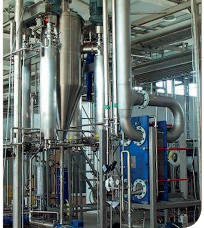
Quadruple Contherm/Convap installation with plate heat exchanger as condenser.

Typical Convap applications include the production of purées, mashes, pulps, concentrate and pastes from fruits and vegetables. Convap units are also suitable for processing a wide selection of confectionery, protein solutions such as whey protein, lecithin, sugar solutions, chemical and pharmaceutical solutions, and for concentrating plant waste materials into heavy slurry for easy disposal. Convap units can also be used for concentrating coffee and other extracts.