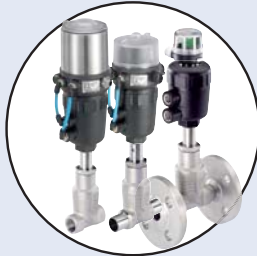
Globe valve On/Off Classic system Type 8801/8803-GA