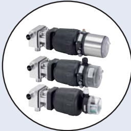
T valve On/Off Classic system Type 8801/8803-TA