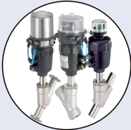
Angle-seat valve On/Off Classic system Type 8801/8803-YA