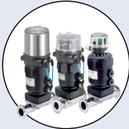
Diaphragm valve On/Off Classic system Type 8801/8803-DB