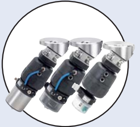
Tank bottom valve On/Off Classic system Type 8801/8803-DG

The design of the System Type 8801 On/Off Classic enables the easy integration of automation modules whether they are electrical/optical position feedback, pneumatic control units, an optional integrated fieldbus interface or even an explosion proof control head.