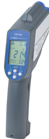
Infrared hand-held thermometer model CTR1000