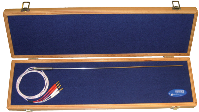
Platinum resistance thermometer model CTP2000