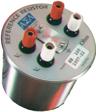
Model CER6000-RR reference resistor with 100 \Omega