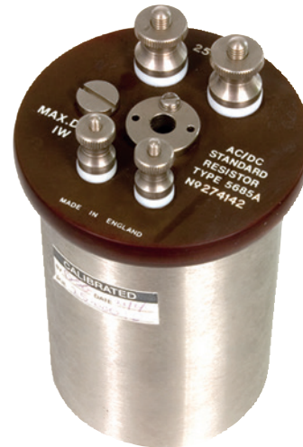
Standard reference resistor, model CER6000, 10 \Omega