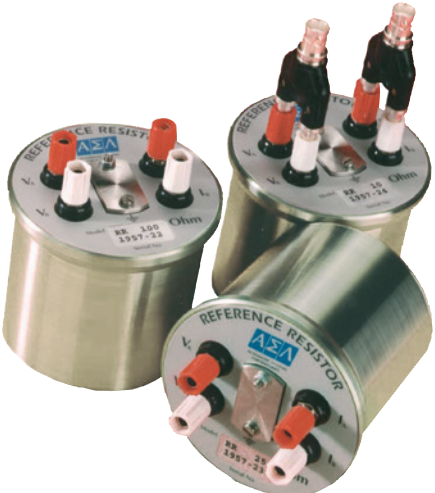
Model CER6000-RR reference resistor with different resistance range